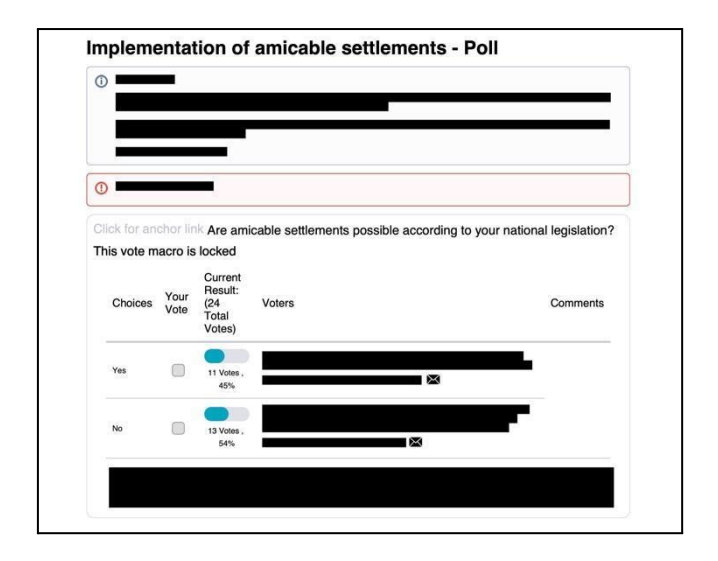
Figure 2 – EDPB Implementation of amicable settlements – Poll (without date)

Another EDPB document appears to compile DPA answers to questions about the rules applying to 'amicable settlements', but it was only shared by its services after being heavily redacted (see Figure 3).<sup>184</sup> Only the answers of three DPAs are at least partially accessible, from Liechtenstein, Hungary, and Finland.